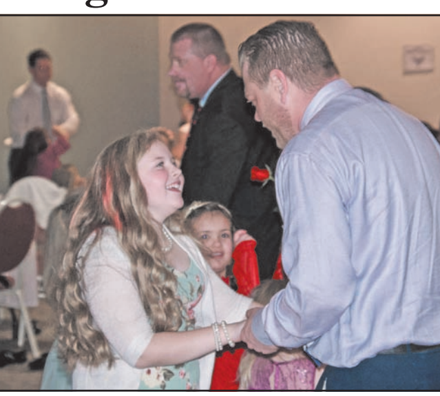
A local father and daughter share a dance at North Georgia Technical College during Daddy/Daughter Night on Feb. 10.